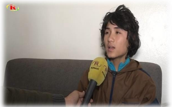
A member of the Cubs of the Caliphate who was arrested while escaping from the camp

On 25 November 2022, a smuggling network in Idleb, a city occupied by Turkey and ruled by Hayat Tahrir Al-Sham (an offshoot of Al-Qaeda), communicated by phone with some members from the so-called "Cubs of the Caliphate". This network provided instructions for ISIS members to coordinate with smugglers to move from Al-Hol camp to Hassakah city and then to Sere Kaniye (which is 70 km from Al-Hol camp and occupied by Turkey and its affiliated factions) and from there to Turkey.